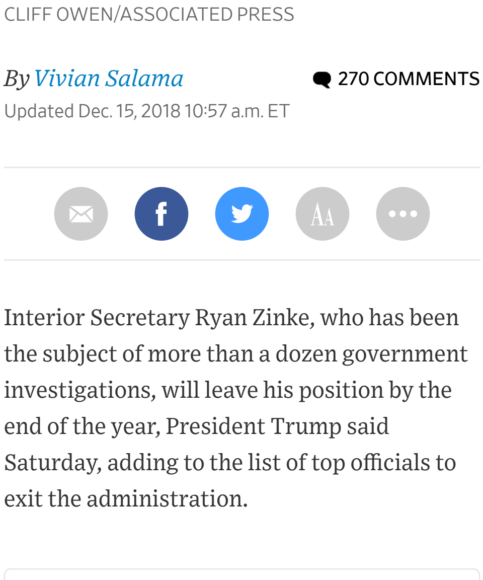
Secretary of the Interior Ryan Zinke will leave his position by the end of the year, President Trump said.

Ryan Zinke has been the subject of more than a dozen government investigations